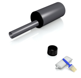
Insert internal drain connector into larger pipe, apply lubricant and push in smaller