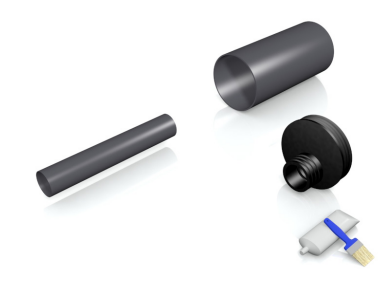
Position pipe ends.